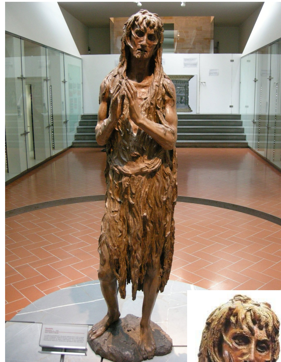
Donatello 1455 1386 - 1466