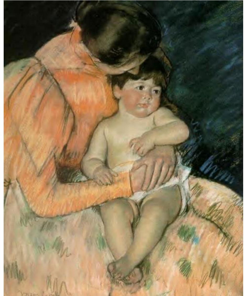
Mary Cassatt Mother and Child 1890