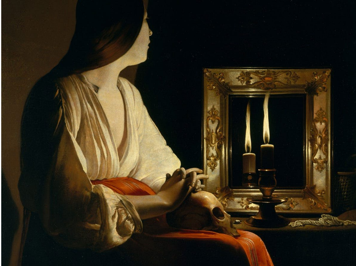
Georges de la Tour 1640 Memento mori 1593 – 1652