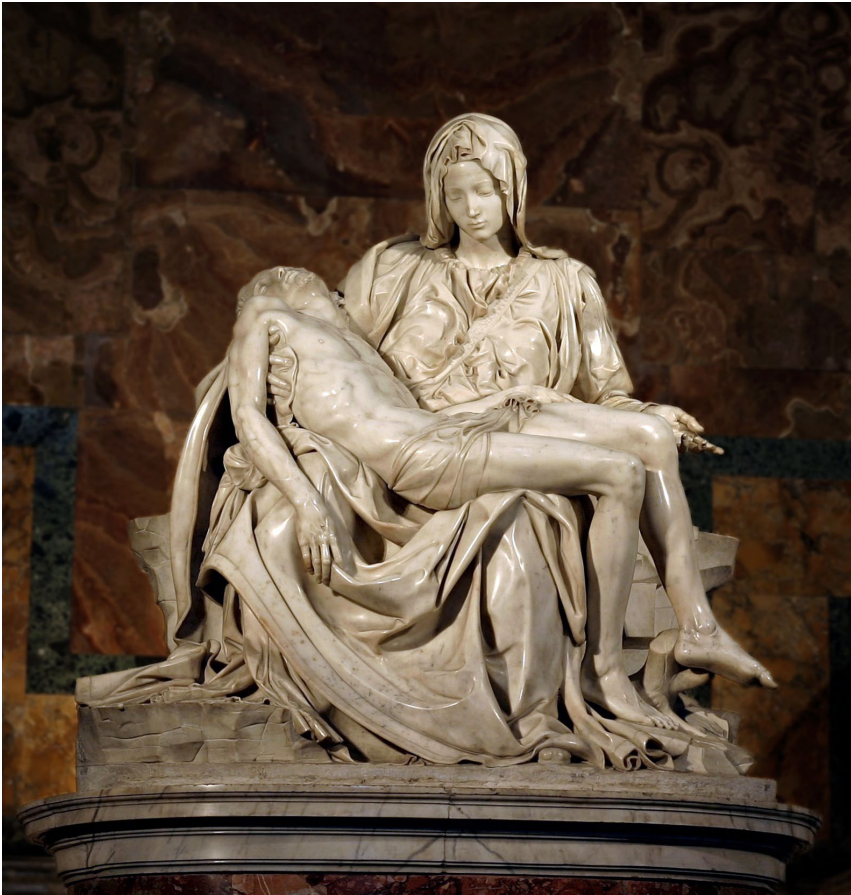
The Pieta 1499