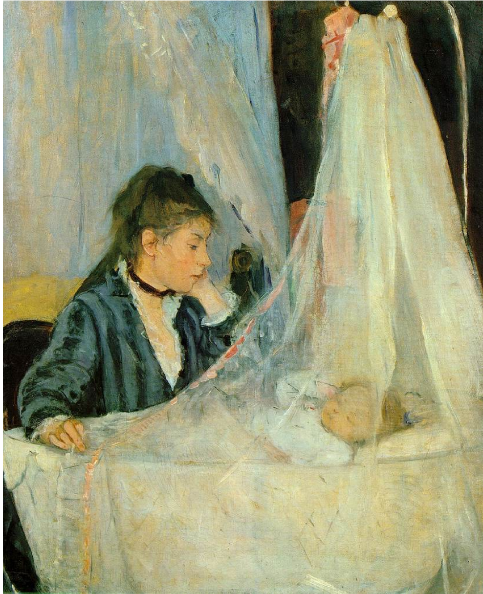
Berthe Morisot The Cradle 1872