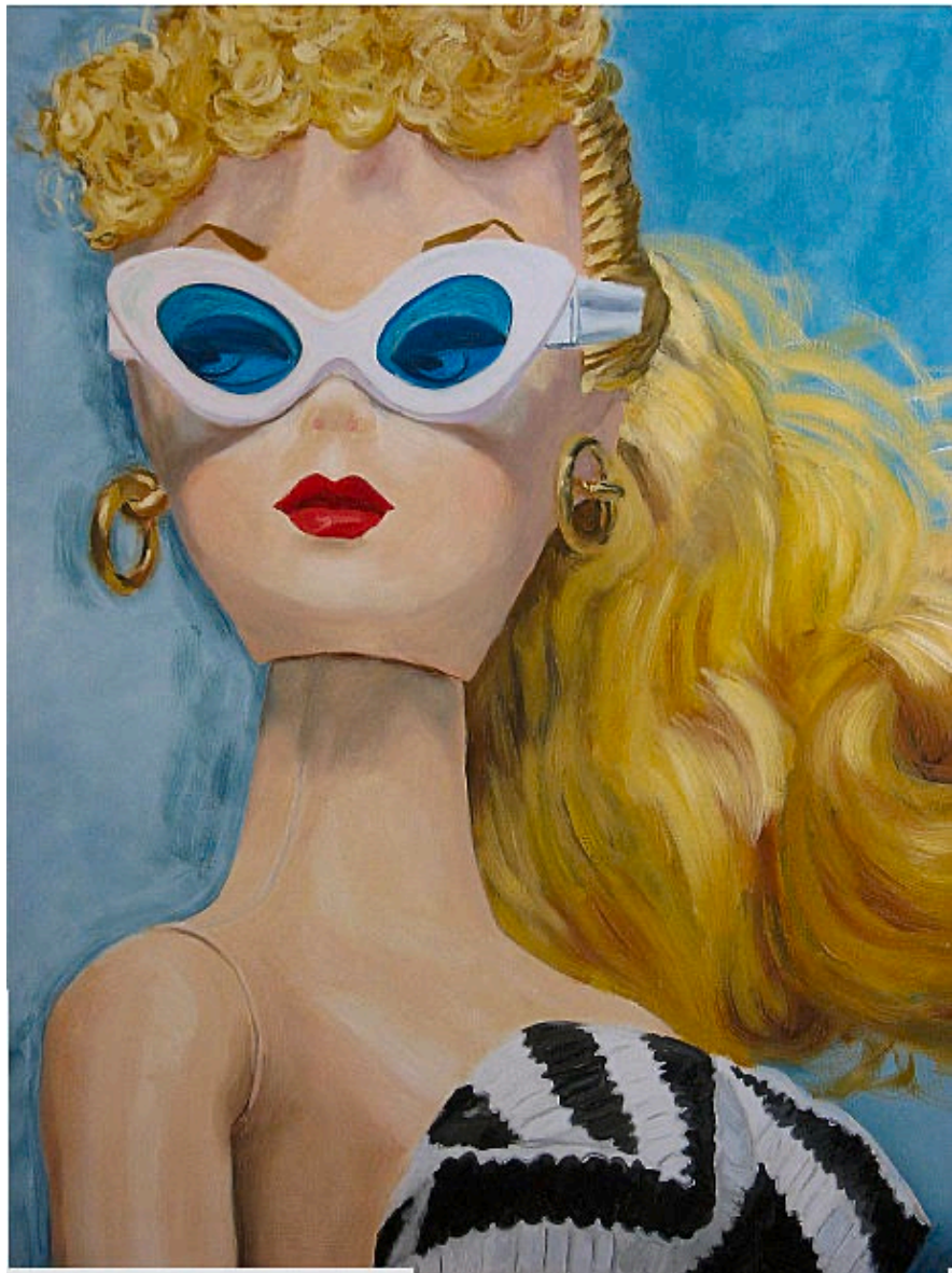
Barbie at the Beach 2020 by Francesca Rocelli