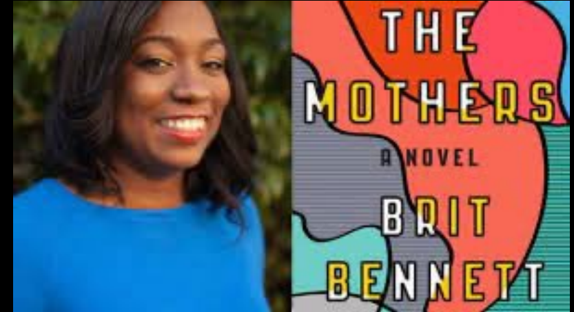
Novel and upcoming movie